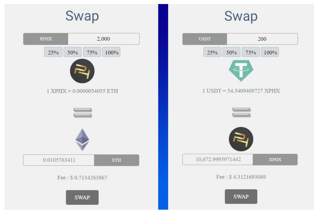
Example : Buying & Selling XPHX in different pairs